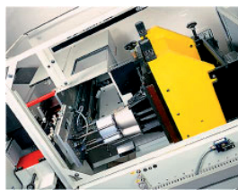
Punching with counter-pressure