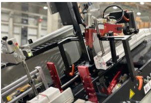
Separating & banding