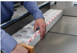
Strip stack infeed