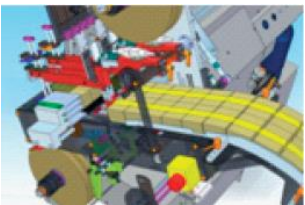
Double Stack Banding