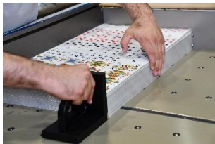
Strip stack infeed