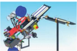
Double Stack – Maxi Pack Banding