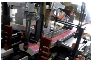
Separating & banding