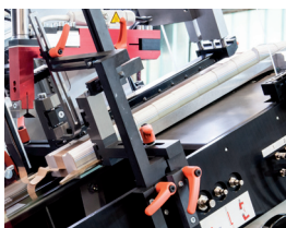
In-line banding process